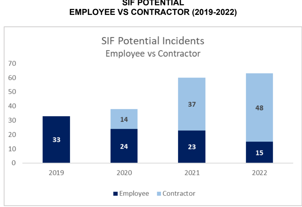
FIGURE 3 SIF POTENTIAL

Note: Graph above is based on number of incidents.