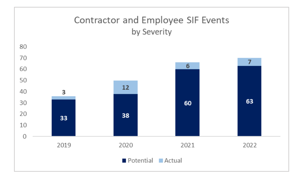
FIGURE 4 CONTRACTOR AND EMPLOYEE SIF EVENTS (2019 – 2022)

Notes: Contractor SIF-P events were not tracked in 2019. Contractor SIF-P tracking started in June 2020. Includes all SIFs.